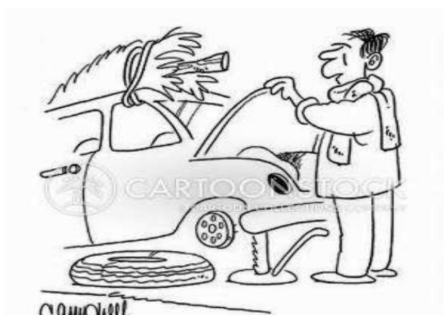
The spare's flat too honey, toss me that fruit cake.