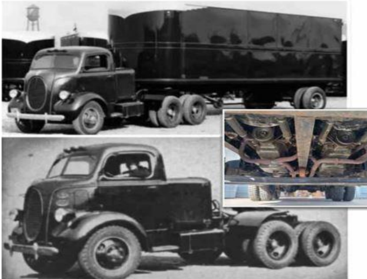
Two engined truck

In 1939, a Motor City company named Grico solved the power problem in trucks in a novel way: with a pair of V8 engines stuffed in a Ford cabover tractor. The Ford COE tractor's original V8 engine, drivetrain, and rear axle were retained. A second V8 engine, transmission, and driveline were installed behind the cab, under a sheet metal housing, driving the second axle in the tandem. The two powertrains were configured so that either one could be operated individually to propel the truck, or they could be run in tandem controlled by a single throttle, clutch pedal, and shift lever. Very Clever.