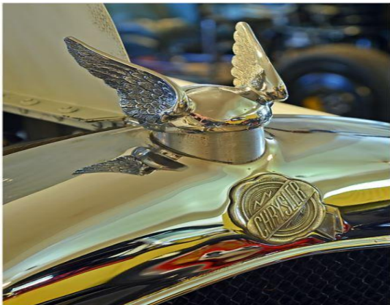
Harry Potter's Golden Snitch