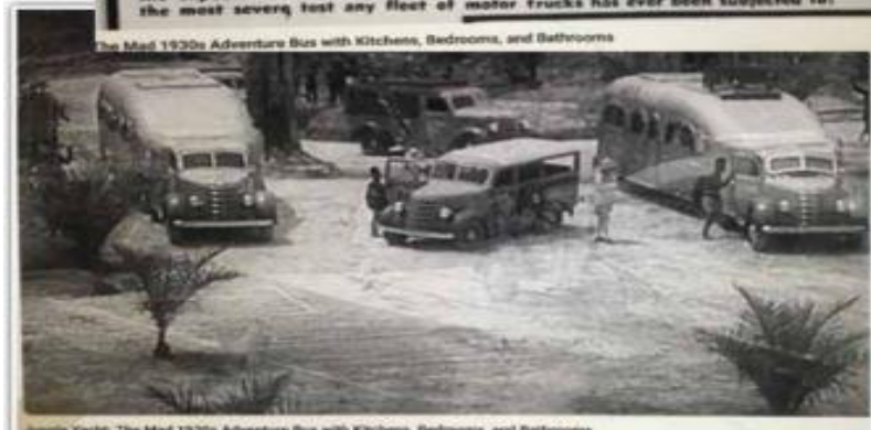
The Mad 1930s Adventure Bus with Kitchens, Bedrooms, and Bathrooms