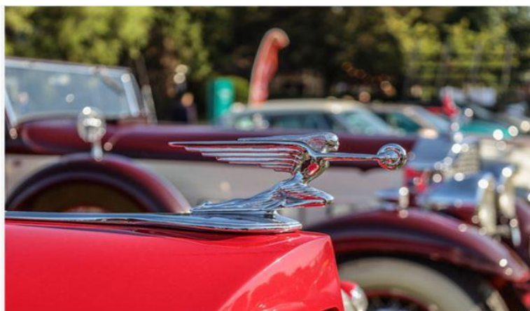
The Doughnut Deliverer