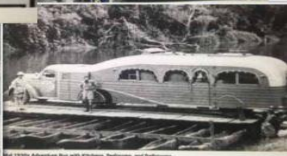
Mad 1930s Adventure Bus with Kitchens, Bedrooms, and Bathrooms