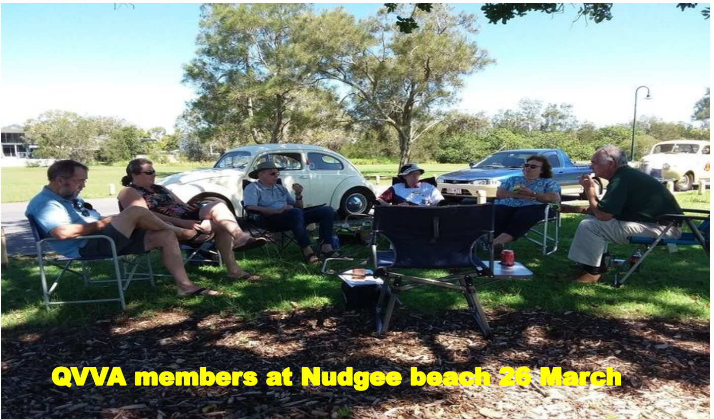
QVVA members at Nudgee beach 26 March