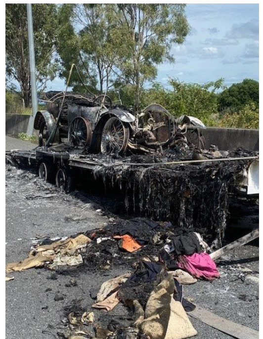
1915 NAPIER AFTER