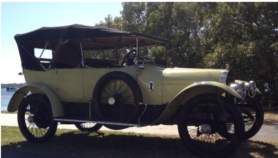
1915 NAPIER BEFORE